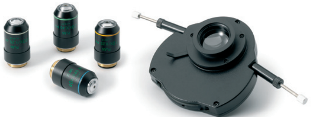
Zernike condenser with infinity plan achromatic phase objectives

Today, fluorescence microscopy offers a faster and reliable identification of infectious diseases and allows observation of complex interactions in unstained living cells. The high contrast plan semi-apochromatic Fluarex 4x, 10x, 20x, S40x and S100x oil objectives combined with the 22 mm eyepieces of the Oxion, offer the necessary resolution and field of view for fast detection of small pathogens. A 100 Watt mercury –vapor light source combined with the high performance fluorescence filters produce excellent contrasted images with an outstanding signal-to-noise ratio.